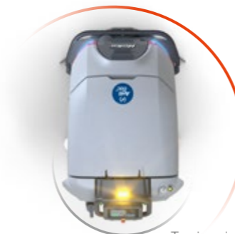
Turning circle d = 130 cm L = 105 cm

The new Scrubmaster B75 i cleans taught routes independently, reliably and safely. The 3D camera system and certified LiDAR sensors not only enable reliable obstacle detection and efficient navigation, but also compliance with safety standards. Operation via the clear 8-inch LCD panel is simple and intuitive. The Scrubmaster B75 i increases productivity as it can perform cleaning tasks at any time of the day or night – particularly efficient, saving time and resources.