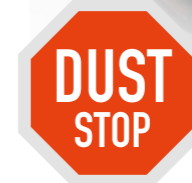
Pre-sweep unit with DustStop