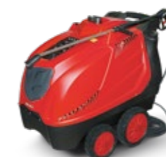
Oertzen H200-21 E.D