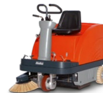
Sweepmaster 900 R