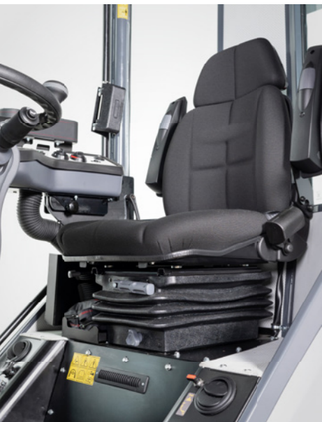
Made for the driver: height adjustment, back rest adjustment and an ergonomic design for comfortable, back-friendly sitting.

A compact powerhouse for all-season use – and a spatial prodigy for the driver: The Citymaster 400 is highly functional and at the same time comfortable and user-friendly. Our dual-benefit solution supports the driver in his daily work to ensure excellent results.